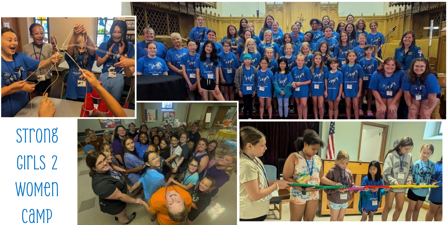
STRONG GIRLS 2 WOMEN CAMP