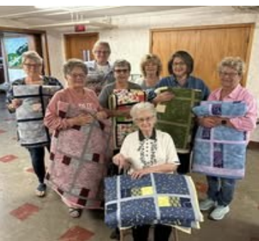
Quilters with their quilts!

baptisms, high school graduates, weddings, new members and church staff. We were delighted to wrap 28 people in God's love with quilts from Immanuel in 2024. HUGE THANKS to all quilters for their generous service!