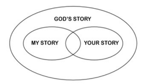
*2013 ELCA Global Mission Gathering - Accompaniment

Accompaniment Model has five core values: